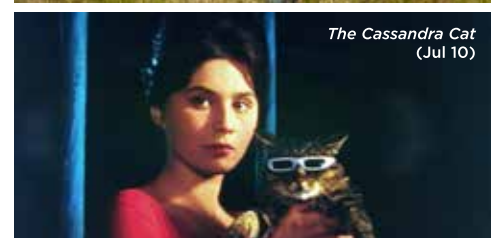
The Cassandra Cat (Jul 10)