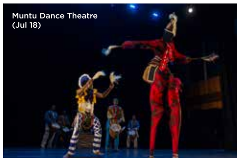
Muntu Dance Theatre (Jul 18)