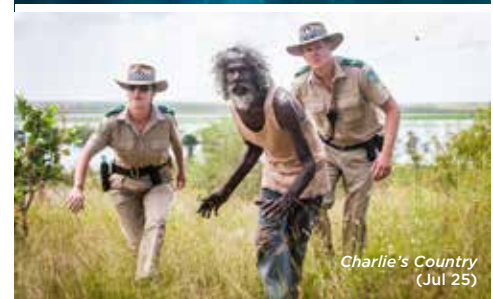
Charlie's Country (Jul 25)