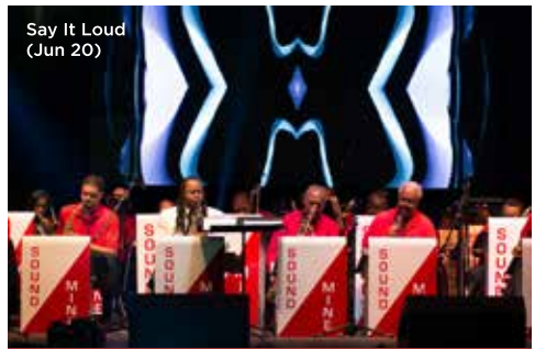
Say It Loud (Jun 20)

Dance show benefit for Beard Elementary School, a CPS school primarily for children with autism spectrum disorders. Featuring Cerqua Rivera Dance Theatre, Gus Giordano Dance School, Hyde Park School of Dance, Joel Hall Youth Dancers, Joffrey Ballet Youth Company, and more. $15–75 (tickets.uchicago.edu, 773.702.ARTS). Presented by the Logan Center and Hyde Park School of Dance.