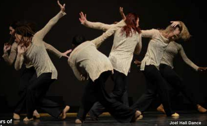
Joel Hall Dance (Aug 7, 8, 14 & 15)

The University of Chicago is a destination where artists, scholars, students, and audiences converge and create. Find a full list of summer events, exhibitions, programs, and classes at arts.uchicago.edu/events .